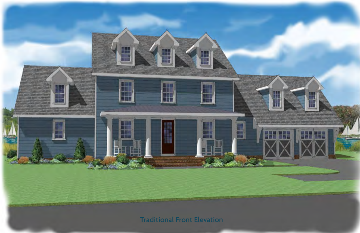
Traditional Front Elevation

4-10 Bedrooms • 3½-7½ Baths • 3,200 - 4,955 SF