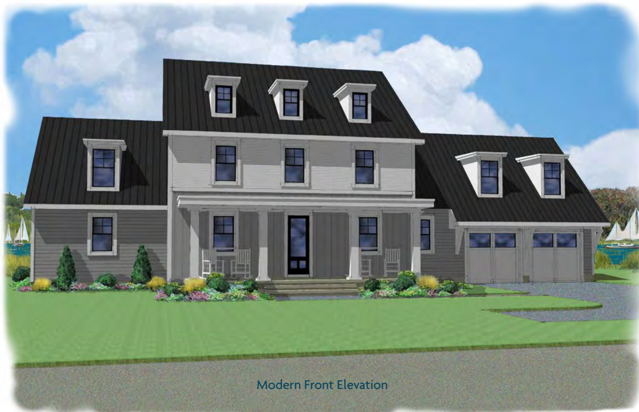
Modern Front Elevation